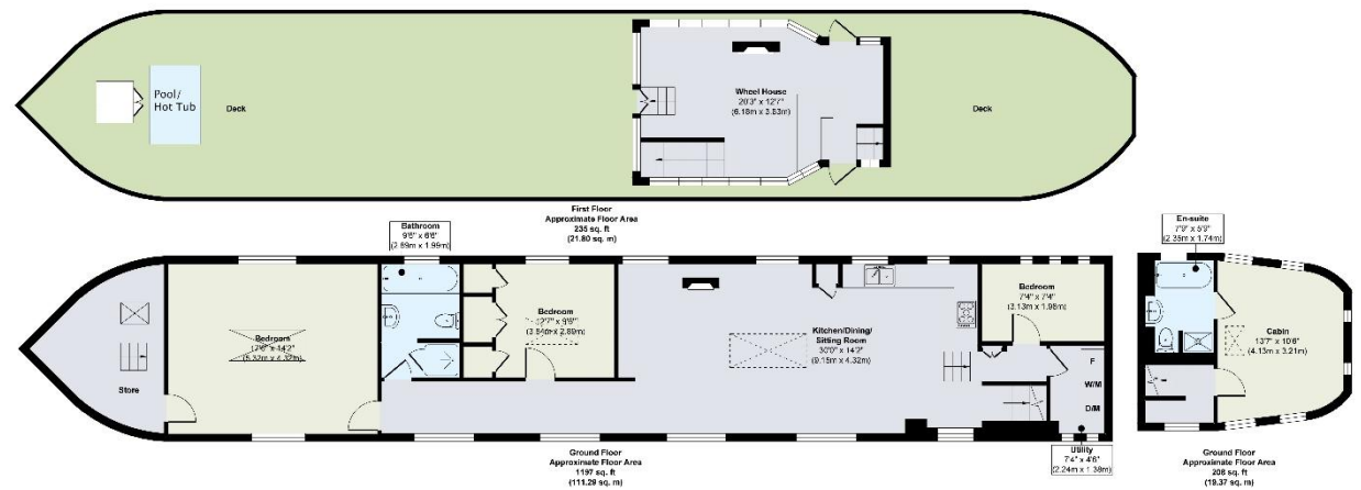
ST. MARY'S WANDSWORTH PIER, SW11

Approx. Gross Internal Floor Area 1640 sq. ft / 152.46 sq. m Illustration for identification purposes only, measurements are approximate, not to scale.